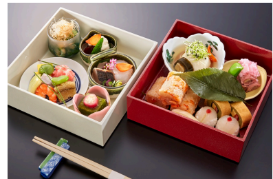
This image is for illustration purposes only

*Sakura Lunch Box will be provided at the hotel lounge any time you like between 12:00pm – 2:00pm.